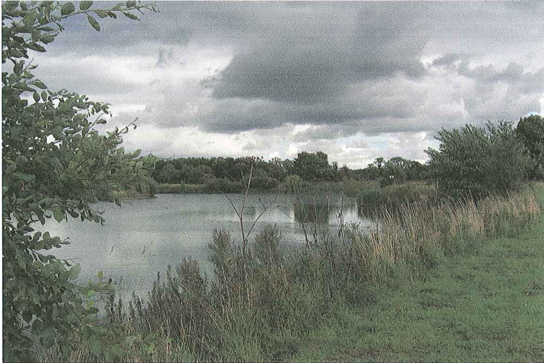
Part of the site as it is today.