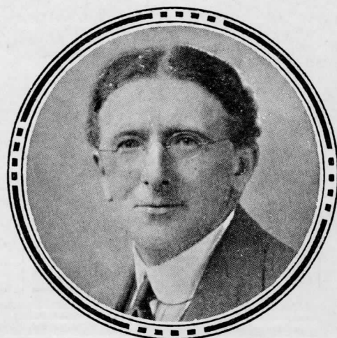
ALBERT W. KETELBEY

In the world of composition, it is true to say that many are called but few are chosen. A thorough knowledge of musical theory is, of course, a sine qua non ; in addition, there are four indispensable requirements of successful light music: Sincerity, emotional impulse, vigour of rhythm, and good craftsmanship.